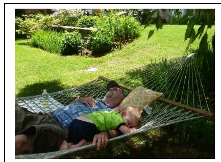
Time for the gardeners to rest.

Besides working in the gardens, spring means the annual raking, reseeding, aerating, liming and fertilizing the lawns.