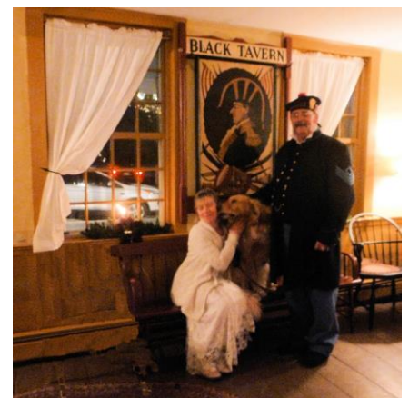
A Civil War Christmas Wedding Reception Took Place At The Tavern in December