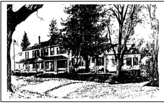
Built In 1804

Black Tavern Historical Society of Dudley, Inc. P.O. Box 143 138-142 Center Road Dudley, MA 01571